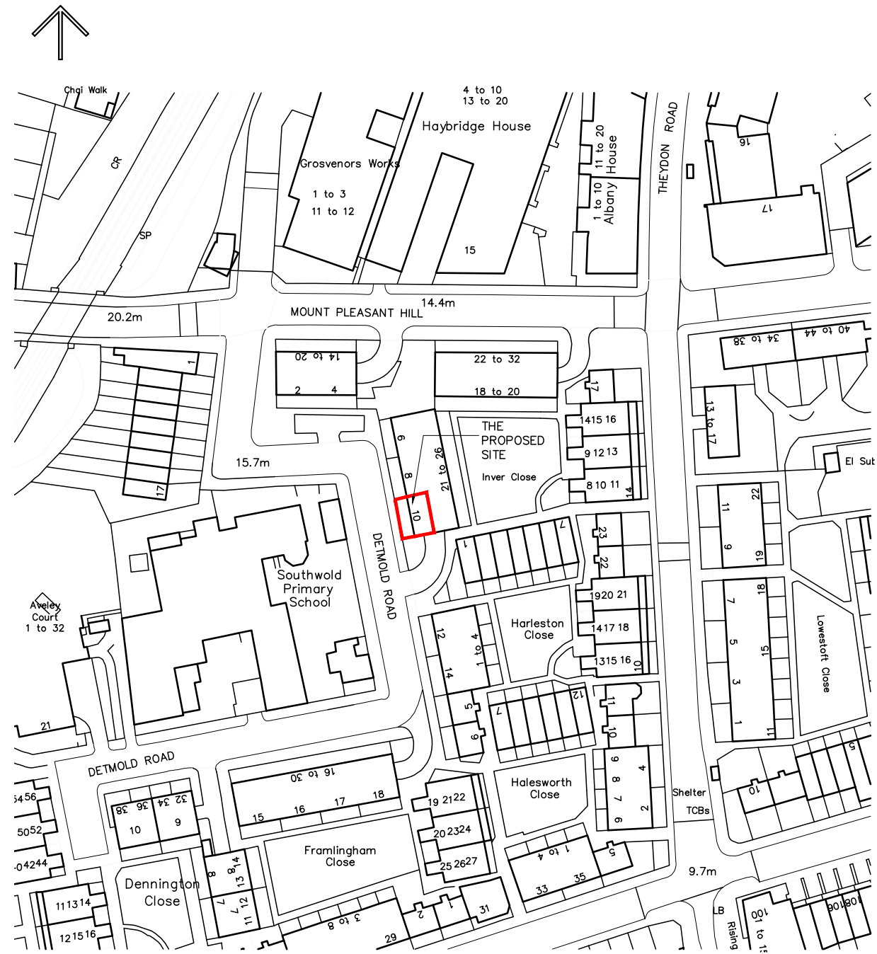
LOCATION PLAN SCALE 1:1250 © A3

Notes: DO NOT SCALE THIS DRAWING UNLESS USED FOR PLANNING PURPOSES. USE FIGURED DIMENSIONS ONLY. CONTRACTORS ARE RESPONSIBLE FOR TAKING AND CHECKING SITE DIMENSIONS. DESIGN COPYRIGHT IS VESTED IN THE ARCHITECT FROM WHOM CONSENT MUST BE OBTAINED FOR COPYING OR REPRODUCING THIS DRAWING.